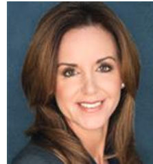
Senator Lizbeth Benacquisto Senate President's Appointee