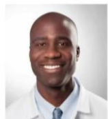
Joseph Ladapo, MD, PhD Florida's Surgeon General