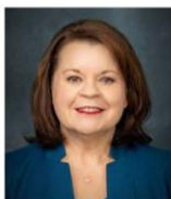
Senator Colleen Burton Senate President's Appointee